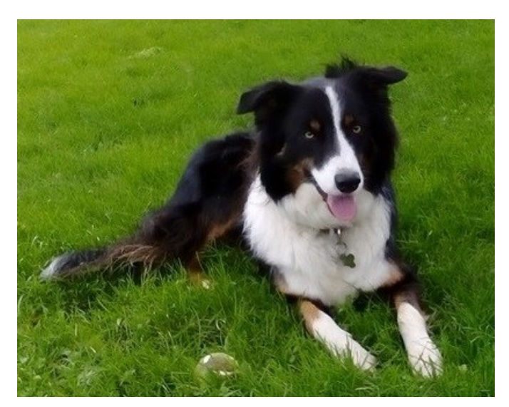
A Canning Road resident

From April it will be compulsory for all dog owners to have their dogs chipped or face a fine of £500.